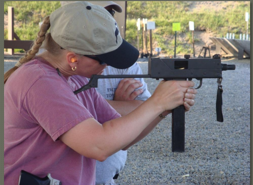
VBCWA Firing Sub-Machinegun